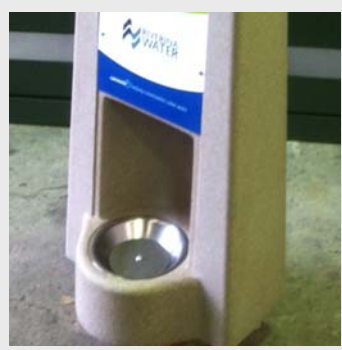
Optional DOG BOWL

“Another Quality Australian Made product from Parkequip”